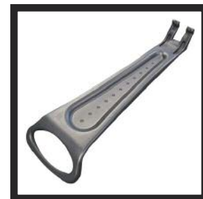
Handle available: H0008604

LINPAC Allibert SAS with a capital of 39,335,642 euros. Headquarters: 2 rue de l'Égalité – 92748 Nanterre Cedex France. Siren: 785 233 339 R.C.S. Nanterre. LINPAC Allibert reserves the right to modify its products in line with any technical developments. October 2009 – N. 302-A - WYATT